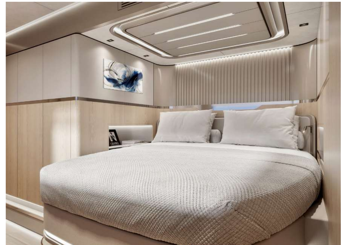
Large windows in the hull invites a lot of light to the cabins. By combining modern lines with warm materials gives you feeling of the cozyness.