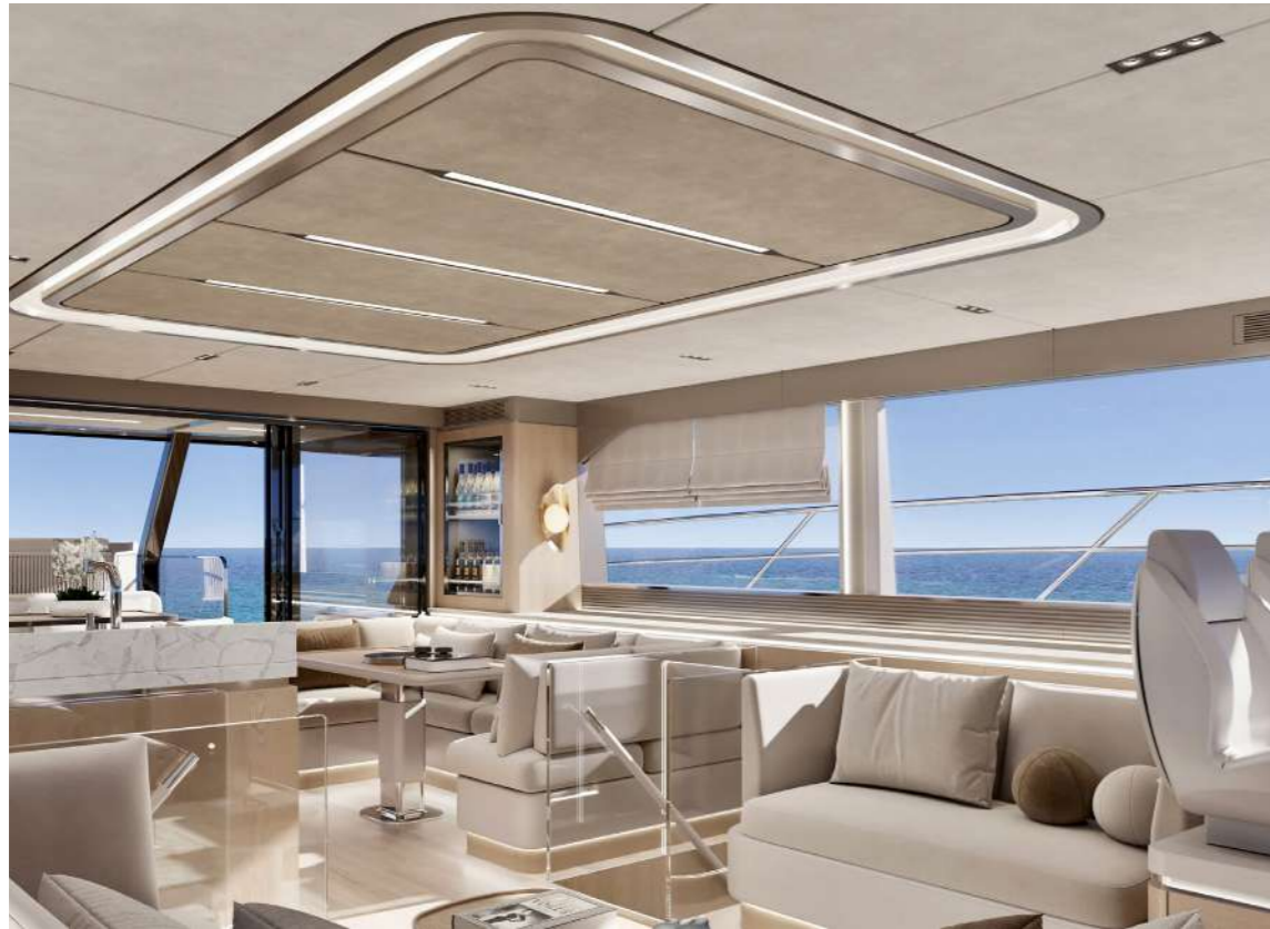
With multiple layout option our Sancrea Ecocat 48 offers you to customize your boat accordingly with your needs.